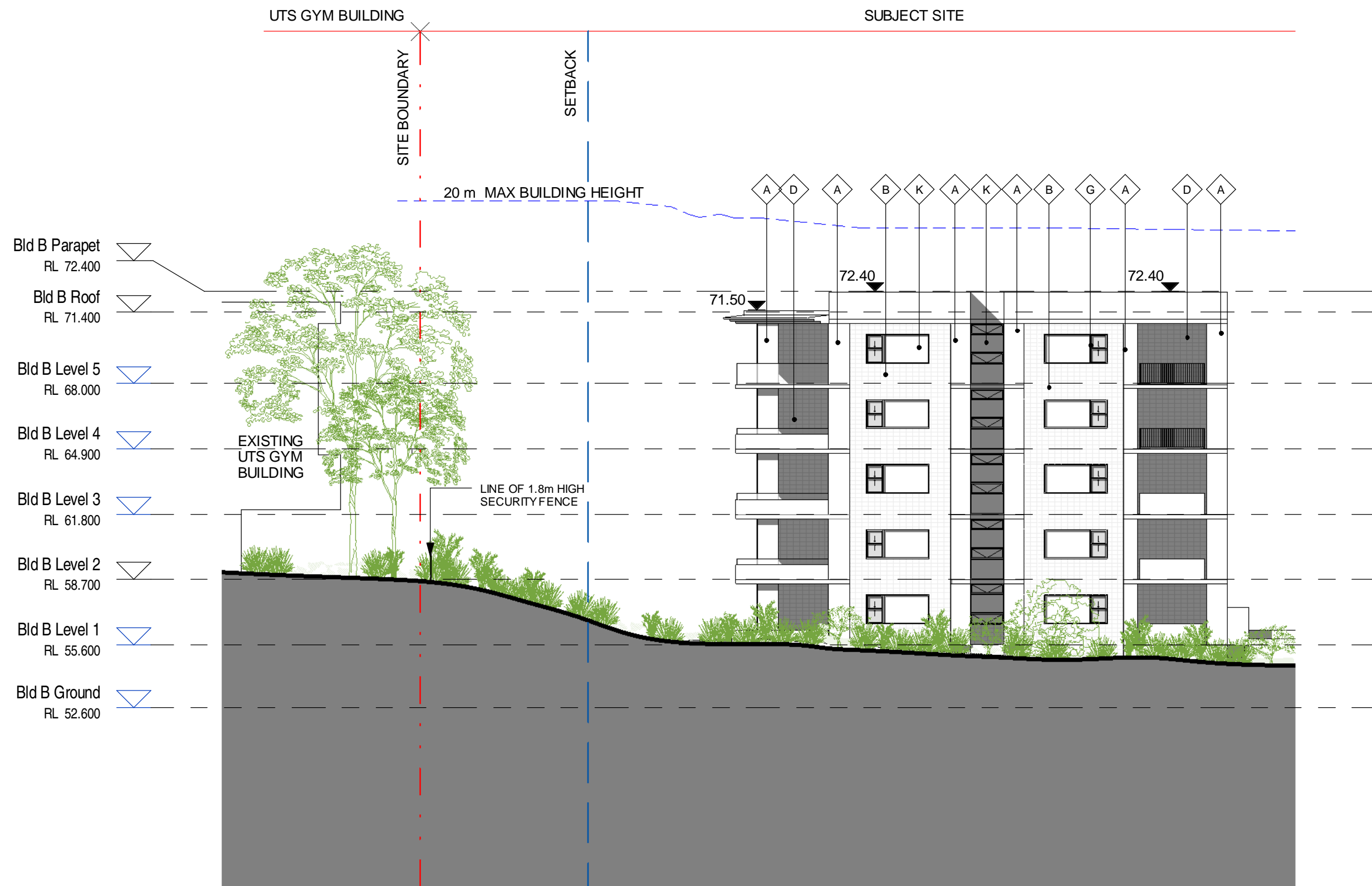
3 Building B - North Elevation Scale: 1 : 200