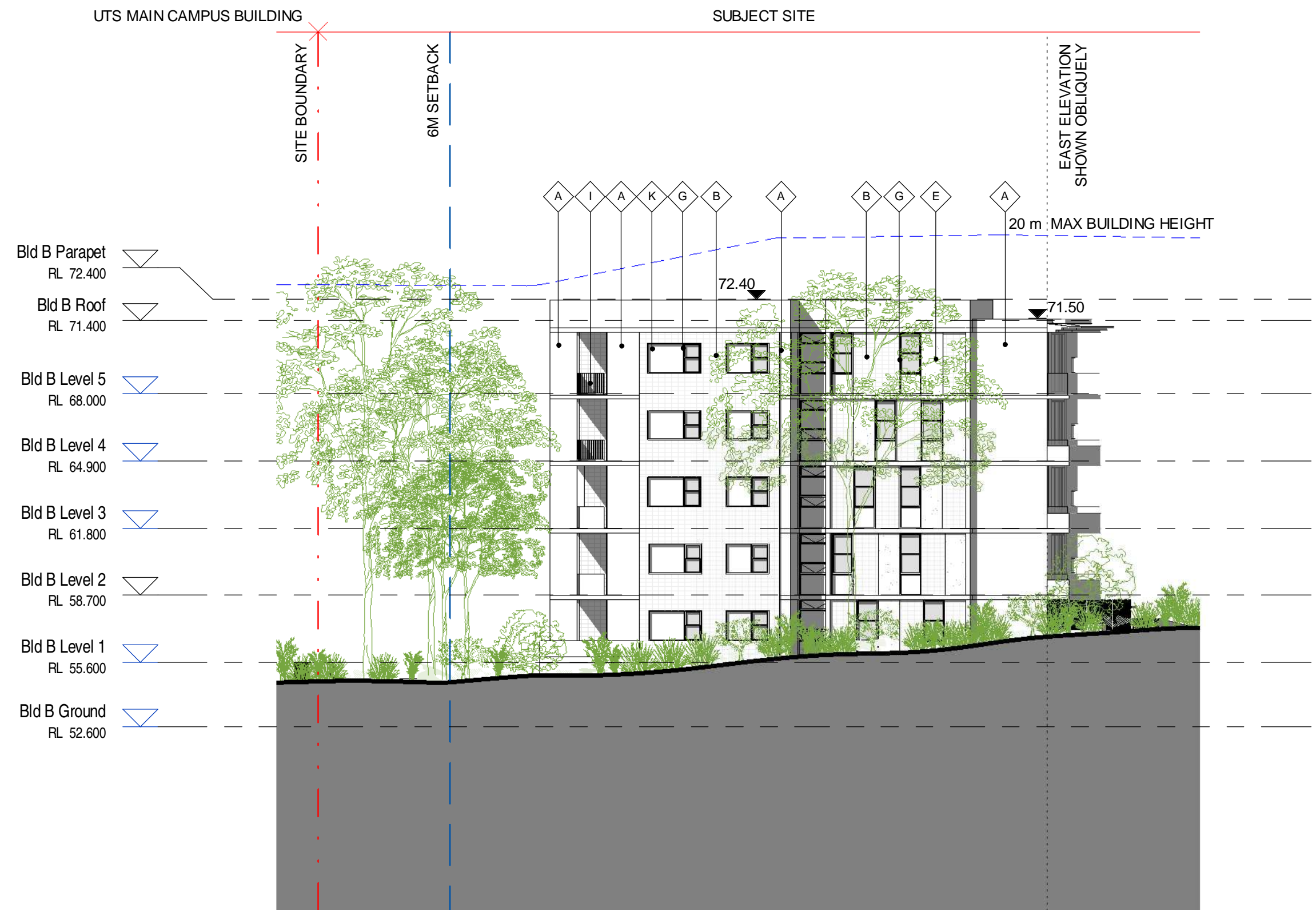
4 Building B - South Elevation Scale: 1 : 200