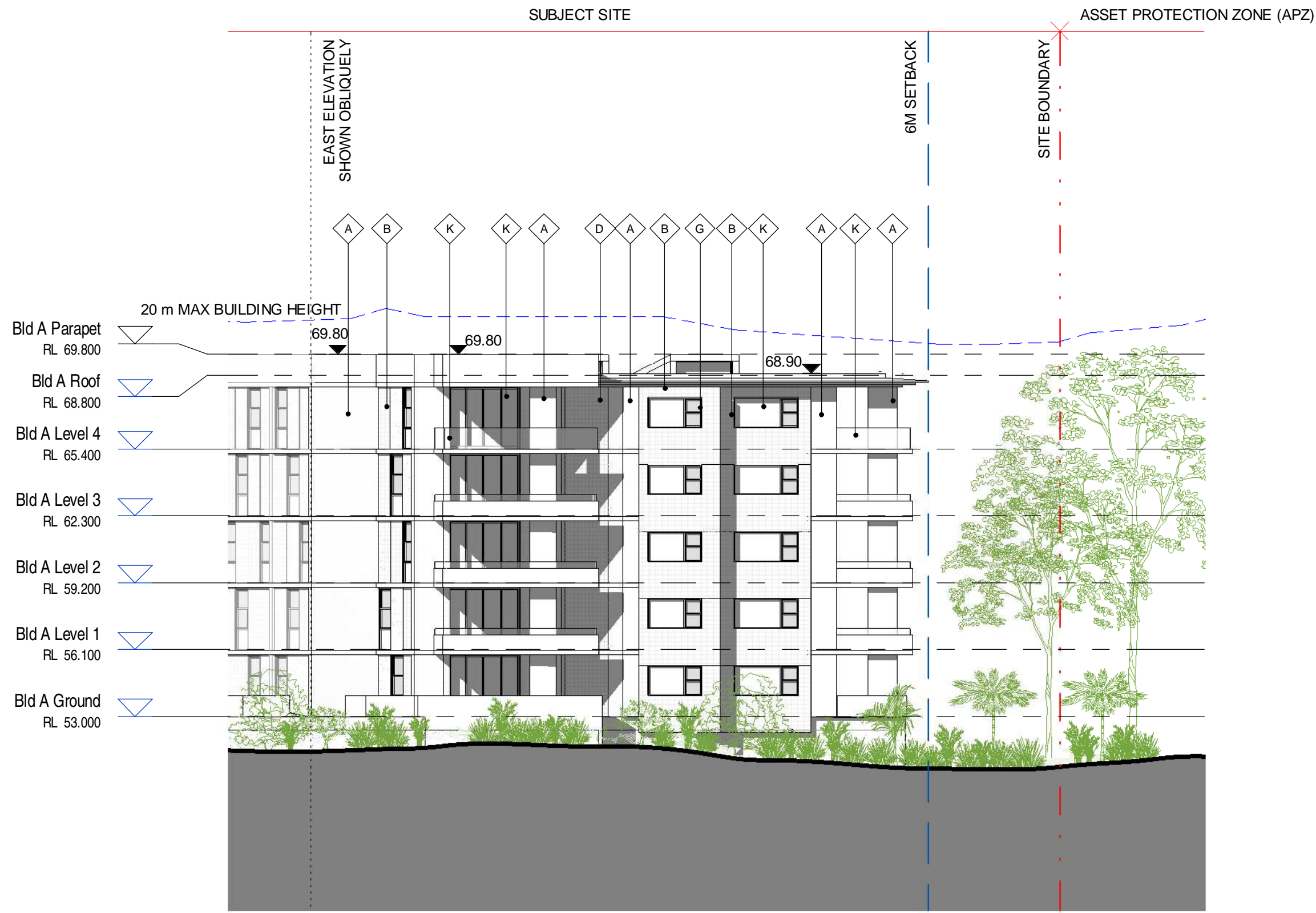
1 Building A - North Elevation Scale: 1 : 200